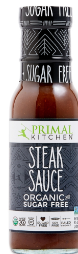
Primal Kitchen Sauces