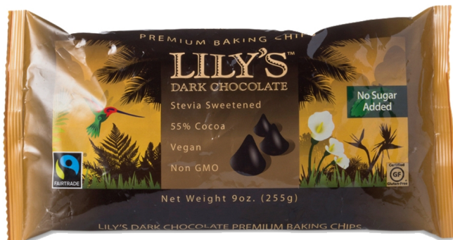
Lily's Stevia Sweetened Chocolate