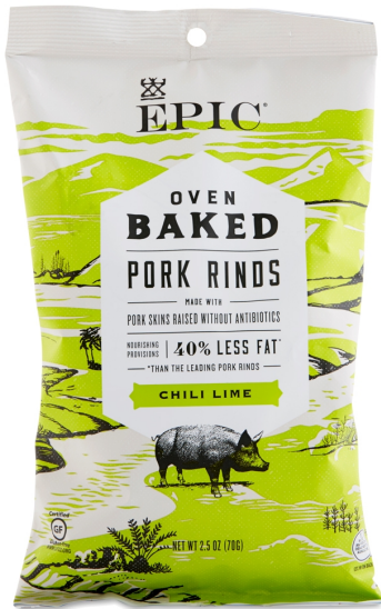
EPIC Oven Baked Pork Rinds *available in other flavors