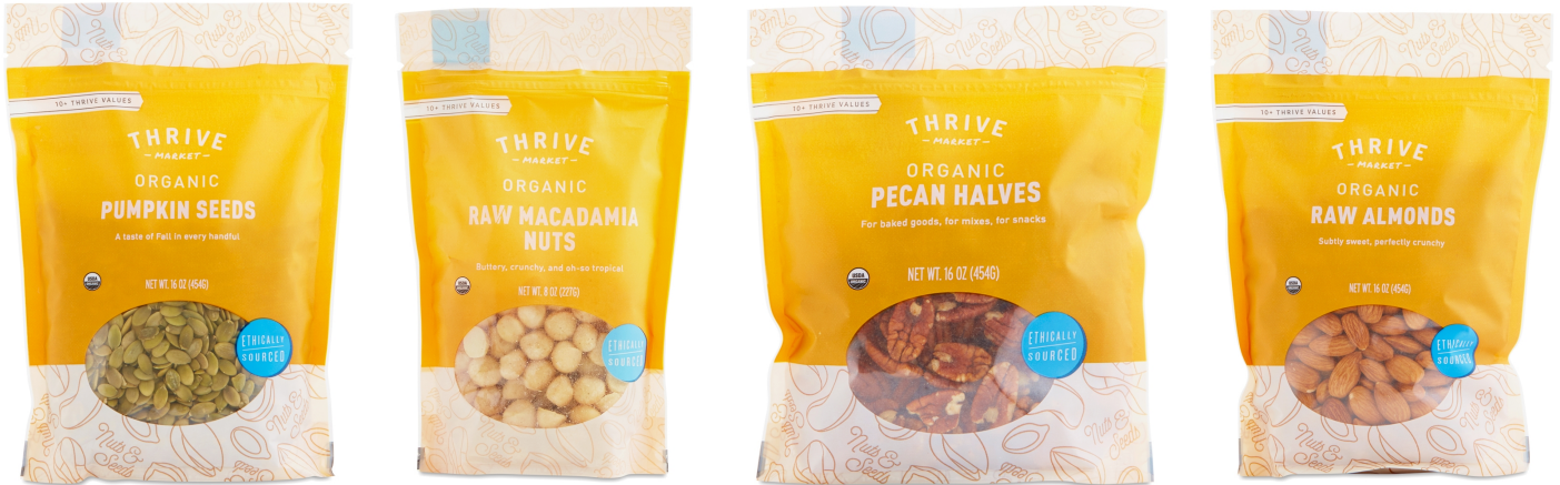
Thrive Market Raw Nuts & Seeds