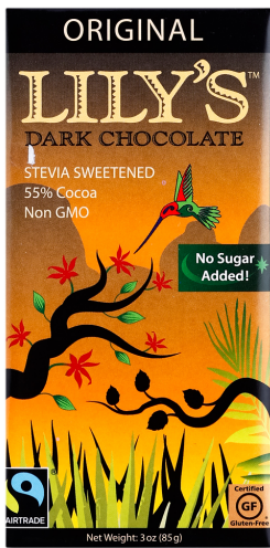
Lily's Stevia Sweetened Chocolate