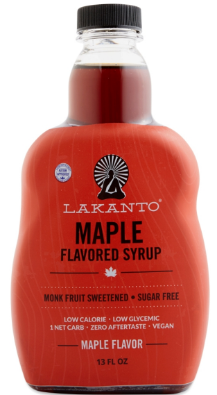
Lakanto Monkfruit Sweeteners (Powder, Stick Packets, Liquid Drops)