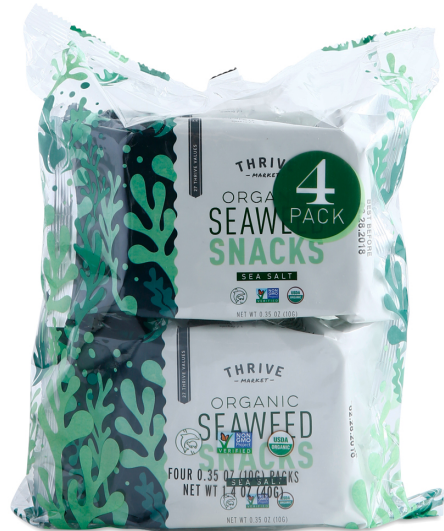
Thrive Market Seaweed Snack