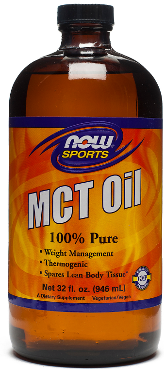
Now Sports MCT Oil