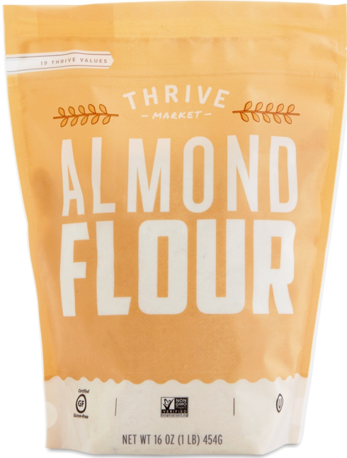
Thrive Market Almond Flour