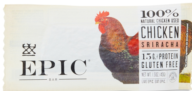
EPIC Chicken Sriracha Bar