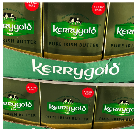
Kerrygold Grass-fed Butter