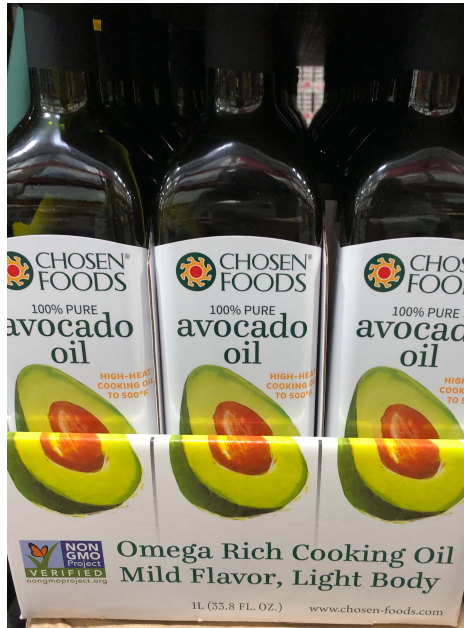
Avocado Oil and Avocado Oil Spray