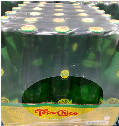
Topo Chico Sparkling Water