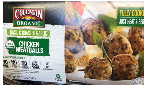
Ready-made Chicken Meatballs