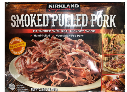
Pre-cooked Pulled Pork