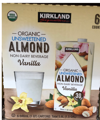
Unsweetened Almond Milk * limit 1/4 C per day