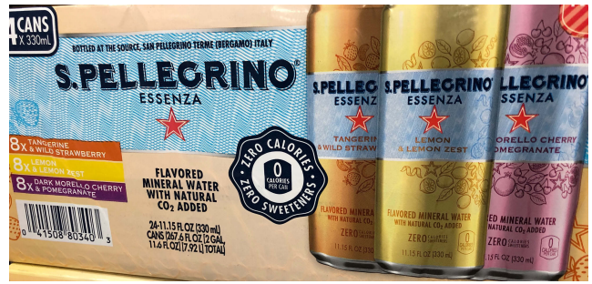
NEW! S. Pellegrino Flavored Sparkling Water