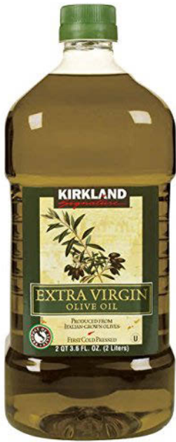
Extra Virgin Olive Oil