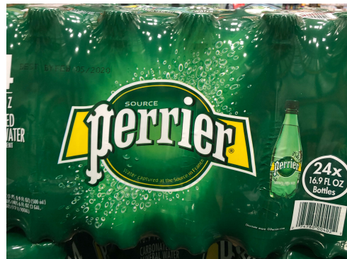
Perrier Sparkling Water