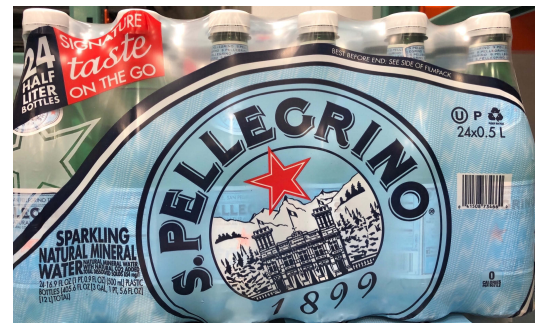
S. Pellegrino Sparkling Water