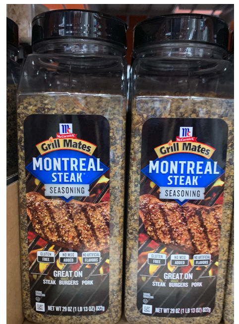
Montreal Steak Seasoning