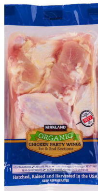
Chicken Wings, Thighs and Drum Sticks