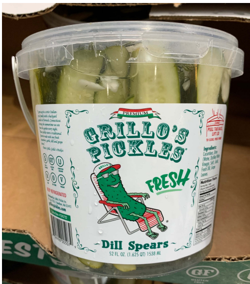
Pickles with NO SUGAR