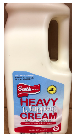
Heavy Whipping Cream * limit 2tbsp per day