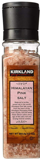
Pink Sea Salt