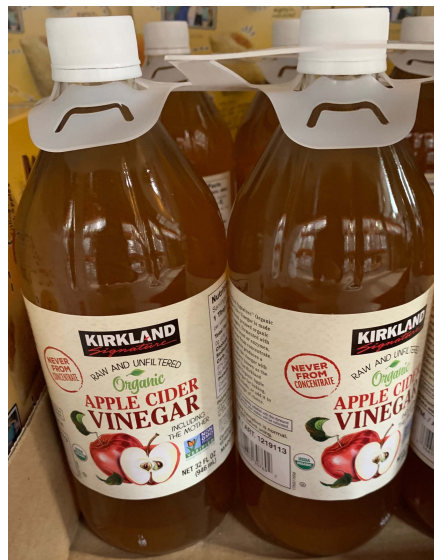
Apple Cider Vinegar