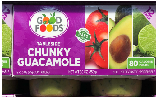
To-Go Guacamole Cups