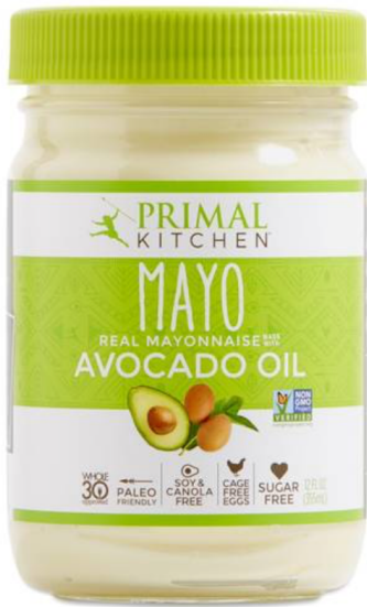
Primal Kitchen Avocado Oil Mayo *please count towards your daily dietary fat allowance