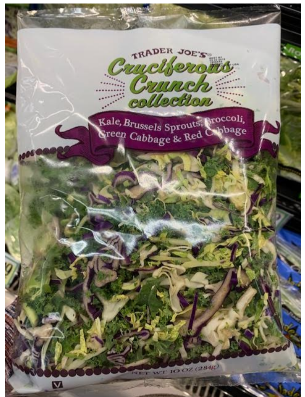
Trader Joe's Salad