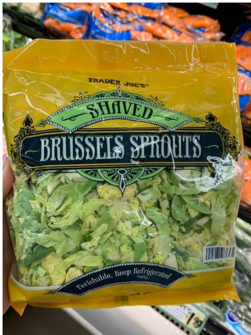
Shaved Brussels Sprouts