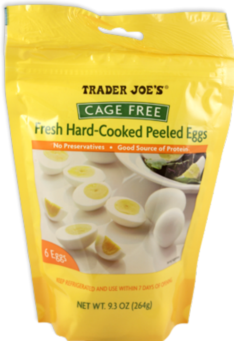
Hard Boil Eggs