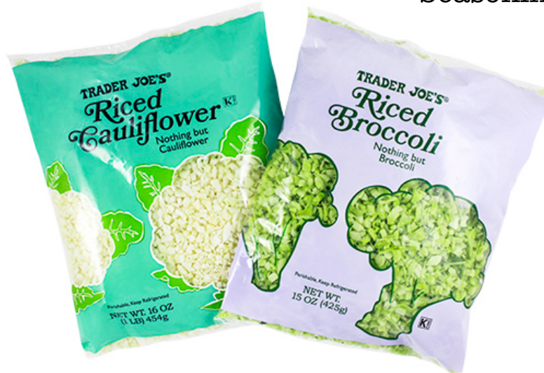
Riced Cauliflower & Broccoli