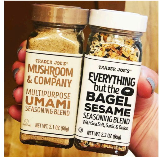
Trader Joe's Seasonings